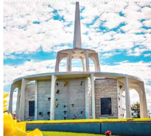
Mausoleum at Memorial Gardens Funeral Home and Memorial Gardens Cemetery

ANSWER: Your instincts are good. What your competitor has suggested is illegal. Our businesses are subject to laws that prohibit the restraint of competition, including price fixing, which inhibits consumer’s ability to select the provider of their choice. You should follow up with your competitor making it clear that the suggested arrangement is inappropriate.